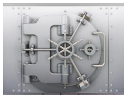
Secure Data Center

Your valuable data is encrypted and stored at an SMI Data Vault secure data center. Without your password and pass phrase, no one else can read or use your confidential information. Not even the staff at SMI Data Vault.